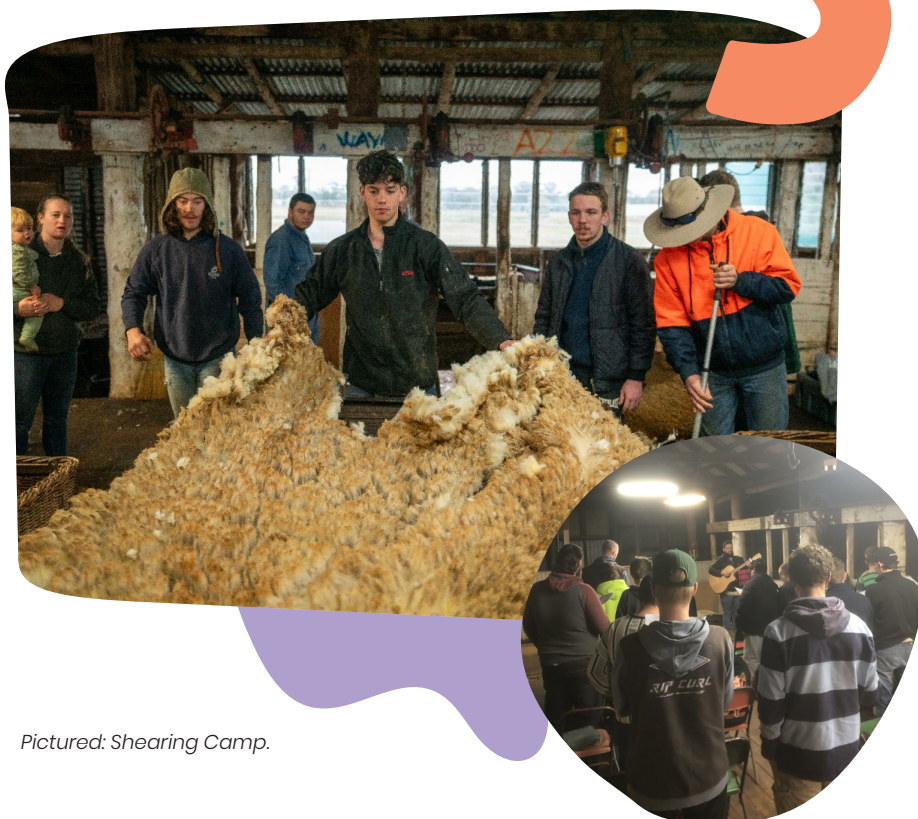
Pictured: Shearing Camp.